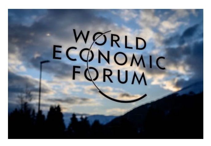
The 50th annual meeting of the World Economic Forum in Davos, Switzerland ends on Jan. 24.