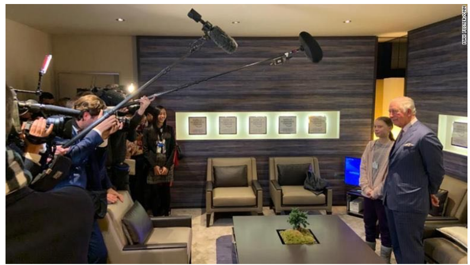
Prince Charles met climate activist Greta Thunberg for the first time on Wednesday.

The Prince of Wales used Wednesday's address to launch his "Sustainable Markets Initiative." He said urgent action was required to reconfigure markets to put people and the planet "at the heart of global value creation."